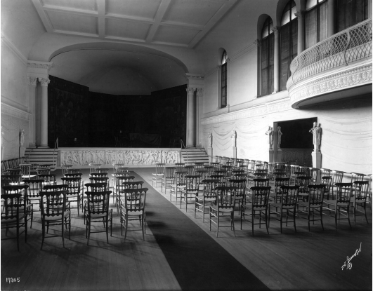
The Music Room, 1903–1914.