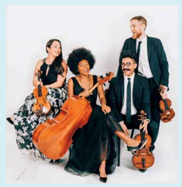
THALEA STRING QUARTET