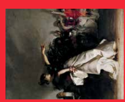
JOHN SINGER SARGENT, EL JALI (DETAIL), 1882