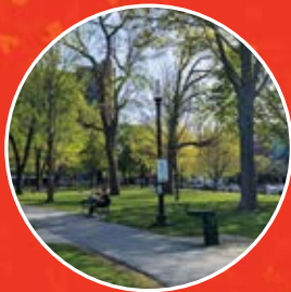
Evans Way Park 1 Evans Way