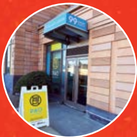
Where We Meet: Imagining Gardens and Futures at Pao Arts Center 99 Albany Street

Gardens can take many forms, both real and imagined. Here, discover some of the public green spaces that can be found between Pao Arts Center and the Isabella Stewart Gardner Museum.