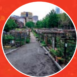
Berkeley Community Garden 500 Tremont Street