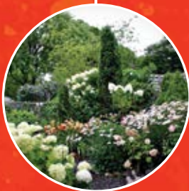
Fenway Victory Gardens 1200 Boylston Street