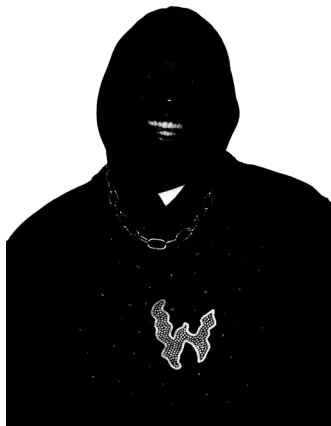
Olivia Slaughter Wayne "Cash" Montague 2024 Silver gelatin print on fiber base paper Collection of the artist ©2024, all rights reserved Olivia Slaughter