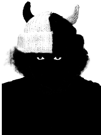
Olivia Slaughter Michael Christmas 2024 Silver gelatin print on fiber base paper Collection of the artist ©2024, all rights reserved Olivia Slaughter