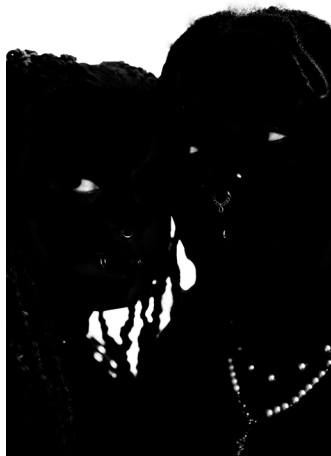
Olivia Slaughter Jasé Gardner and Seraphim Sea 2024 Silver gelatin print on fiber base paper Collection of the artist ©2024, all rights reserved Olivia Slaughter