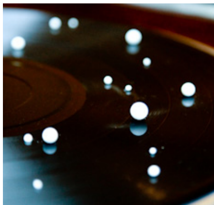
Image: Su-Mei Tse, Floating Memories, 2009

On view July 16 to October 18, 2009 | Advance Press Preview Event • Wednesday, July 15, 9:00 AM