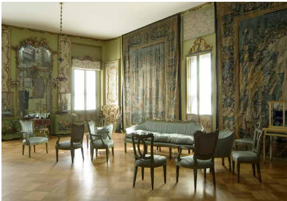
Sofa and Chairs (11 pieces total) Italian (Venice), about 1780 Painted wood

The Little Salon combines the lightness of the 18th century with the dense layering characteristic of Gardner's own time. The painted and gilded wooden panels that once decorated the interior of a Venetian palace show the delicate, curving floral patterns and pastel colors typical of late 18th century art. Tapestries showing couples strolling in front of imaginary country houses continue the garden theme. In the center, a table set for tea suggests the hospitality for which the museum's founder was justly famous.